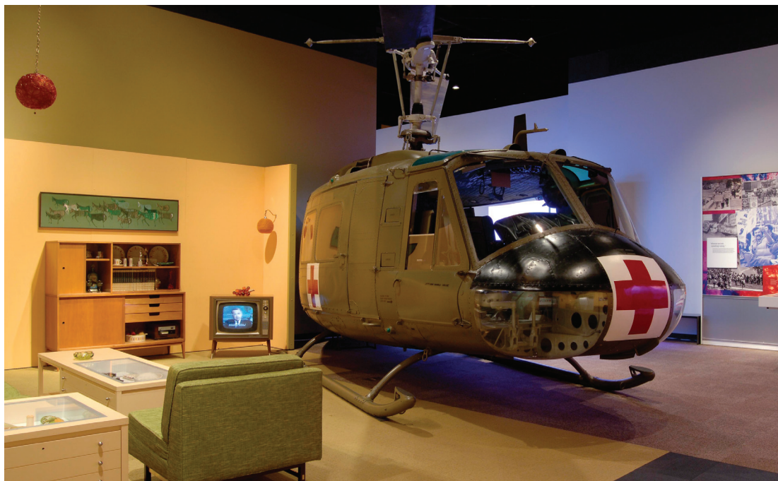
Visitors to the 1968 exhibition, which opens in February 2013, can view an Apollo space capsule and Huey helicopter.

Beginning in November, the History Center will debut a long-term exhibition that