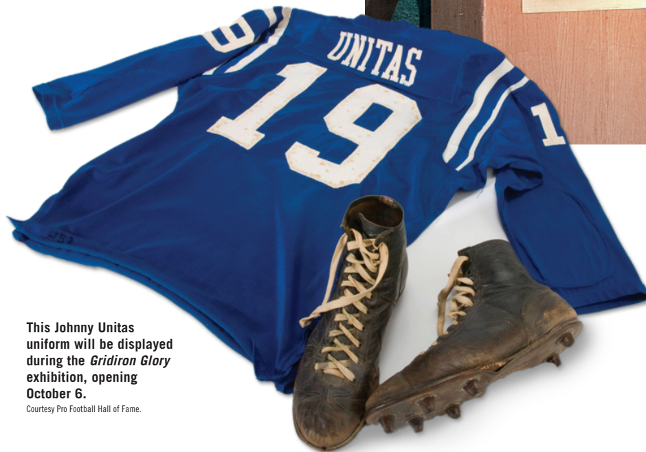
This Johnny Unitas uniform will be displayed during the Gridiron Glory exhibition, opening October 6.