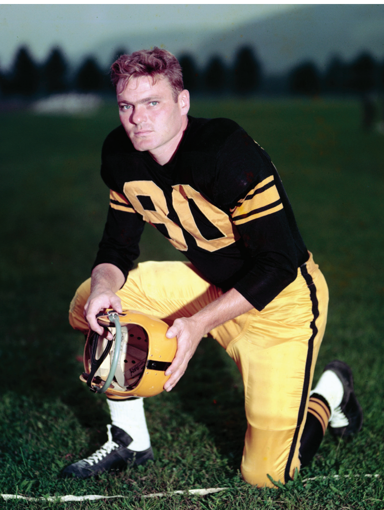
Jack Butler rose from an undrafted free agent to a four-time Pro Bowl (1956-'59) defensive back for the Steelers. He was inducted into the Pro Football Hall of Fame in 2012.