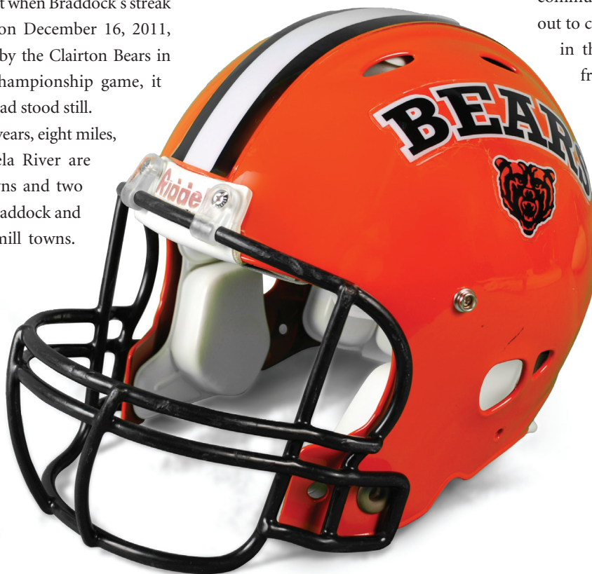
Clairton helmet, 2011 state championship season.