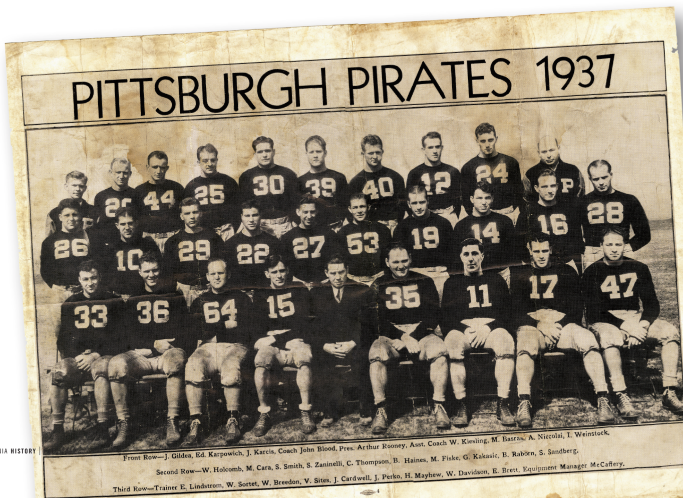
1937 Pirates football team.

Although the 33-year-old future Hall of Famer had put together a remarkable career, primarily as a halfback with Curly Lambeau's Green Bay Packers, McNally's off-the-field antics often overshadowed his accomplishments in the game. The unpredictable player (who inspired George Clooney's character in the film Leatherheads ) 4 was known for driving a car onto railroad tracks so he could stop a train he had missed and escaping a locked sixth-