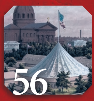
All's Fair: Philadelphia and the Civil War Sanitary Fair