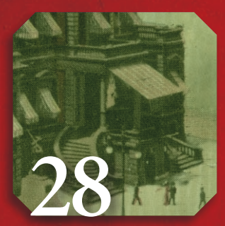
The Union League of Philadelphia and the Civil War