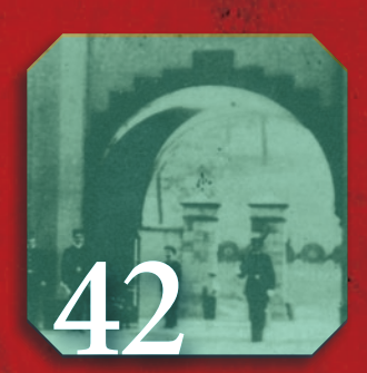
Behind the Scenes of the Allegheny Arsenal Explosion