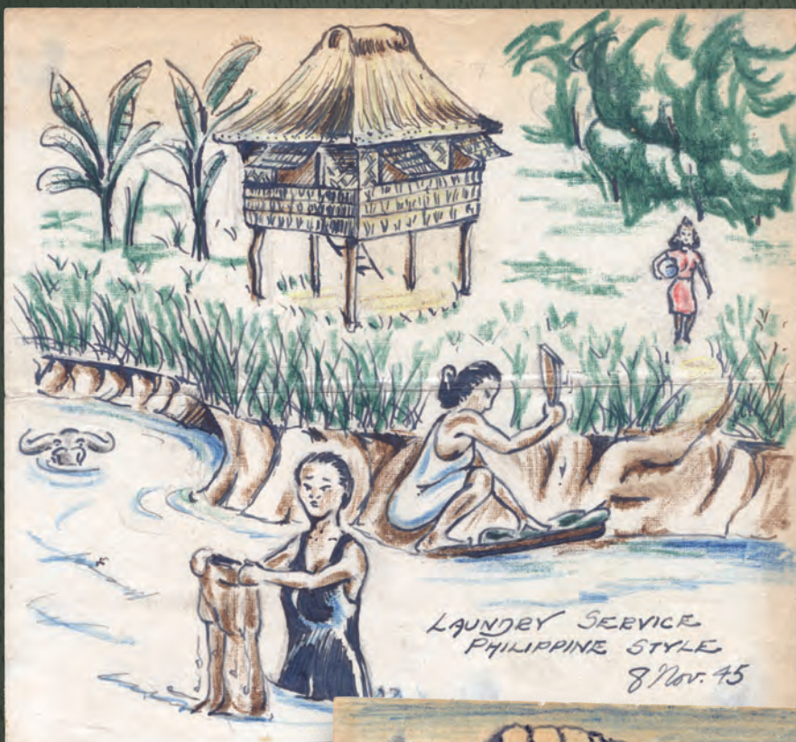
ABOVE Philippine-style laundry service, from a letter dated November 8, 1945.