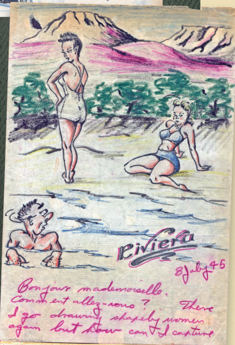
RIGHT July 8, 1945, on leave in the south of France.

to pass the time. Illustrating his homesickness, one of his last drawings depicts his idea to make use of his command of a cannon company to get himself stateside in case the Navy ran out of boats.