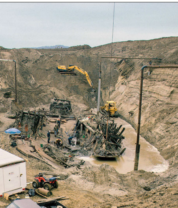
Excavating the Arabia was a massive undertaking. Arabia Steamboat Museum.