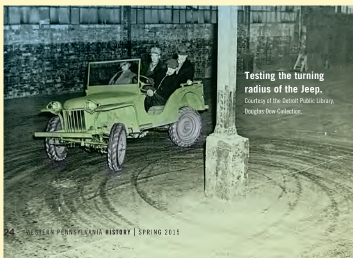
Testing the turning radius of the Jeep.

Alas, Bantam’s design was government property (as was the case with all U.S. military contracts). After 1941, they lost the larger production contracts to the Willys-Overland Company. To add insult to injury, the latter claimed that the design for the Jeep was theirs. Then in 1943, an official federal government investigation confirmed once and for all that the birth of the Jeep rested with the American Bantam Car Company. 5 Today, visitors can see this legacy first hand. The earliest surviving Bantam Reconnaissance Car, from that group of 70, is on loan courtesy of the Smithsonian Institution, in the Heinz History Center’s exhibit We Can Do It! WWII .