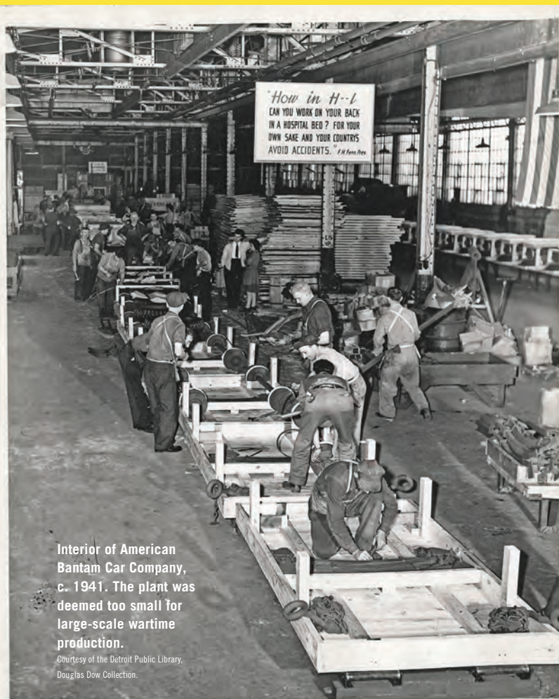
Interior of American Bantam Car Company, c. 1941. The plant was deemed too small for large-scale wartime production.

Bantam, after years of financial difficulty, was broke. The company had only a skeleton crew by the time the Army announced the bid. Nonetheless, Bantam gave the project everything it had and became the only company to successfully meet the