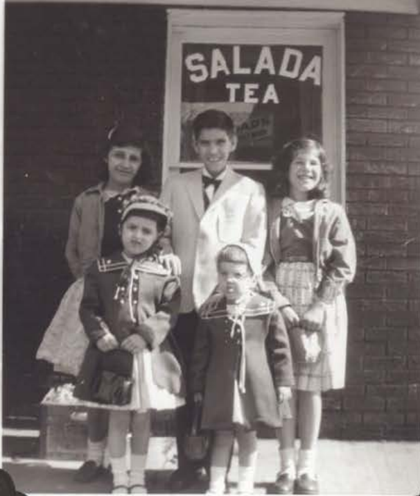
Cousins gather at the family grocery, Easter Sunday, 1958. The author is at front left.

She survived separation from her family of origin, the loss of a child, a hollow marriage, endless work—and created a legacy of love.