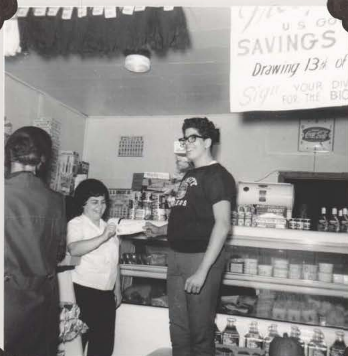
The grocery served the neighborhood from 1925 until the late 1960s. After Pasquale's death in 1959, his adult children kept the store open for another decade.