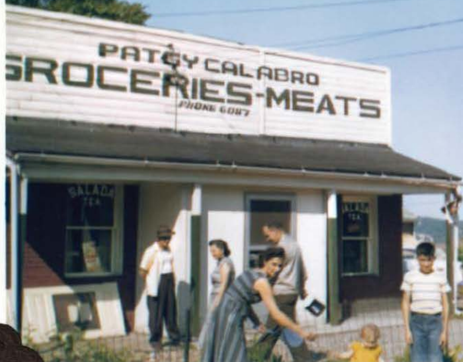
Calabro grocery, located on a hill in the west end of Washington, Pa. 1959.

People often associate warmth and color with Italian American family life—comforting food, generous affection. Certainly, these associations ring true for many. But the life my paternal grandparents made in Western Pennsylvania a century ago doesn't quite fit that image. Their experiences were rather cheerless and my thoughts have always glanced off the rough surfaces of their lives—especially the seemingly loveless relationship between my inexpressive grandfather and the all-but-invisible woman who was his wife.