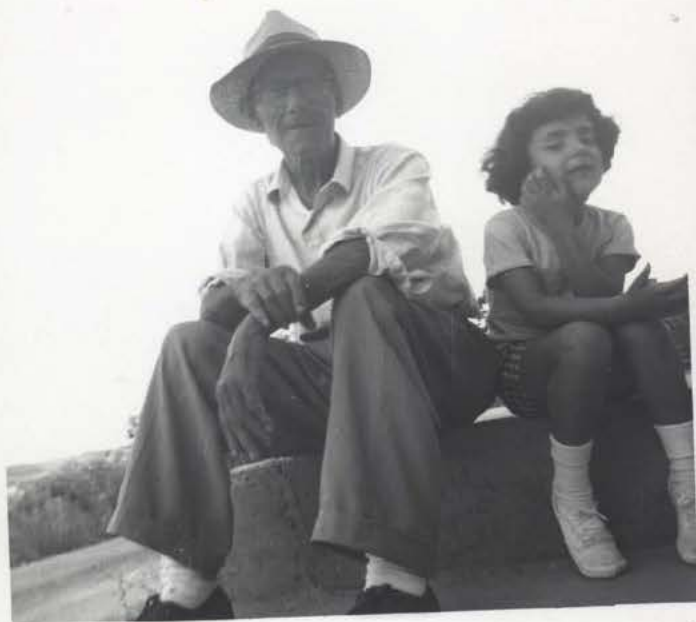
The author with her grandfather, 1959.