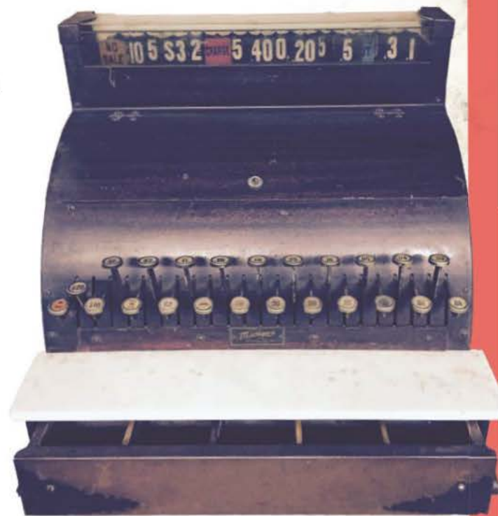
Grocery cash register.