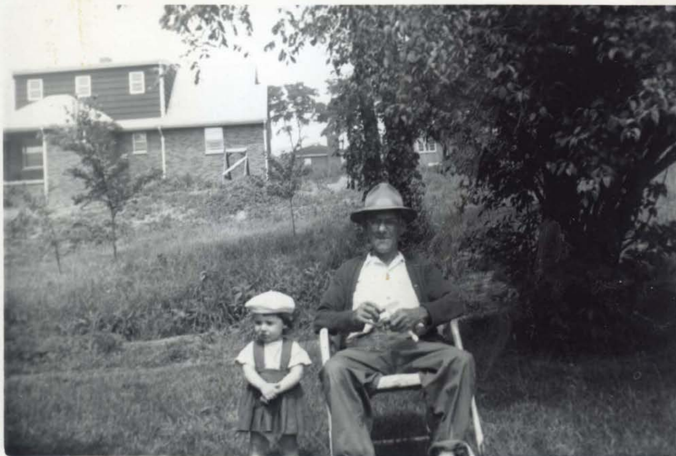
The author with her grandfather, 1954.

We older grandchildren recall our grandfather as a constant builder, pick and shovel in hand.