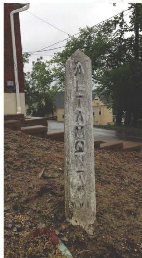
The original stone marker for Altamont Avenue is still in place. Behind the marker is one of the houses built by Pasquale Calabro “up on the hill” in the 1950s.

Rudolph J. Vecoli, “Introduction,” Italian Immigrants , 4.