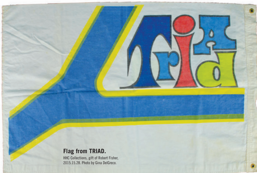
Flag from TRIAD.

In addition, TRIAD led the efforts to clean up and stop erosion on Nine Mile