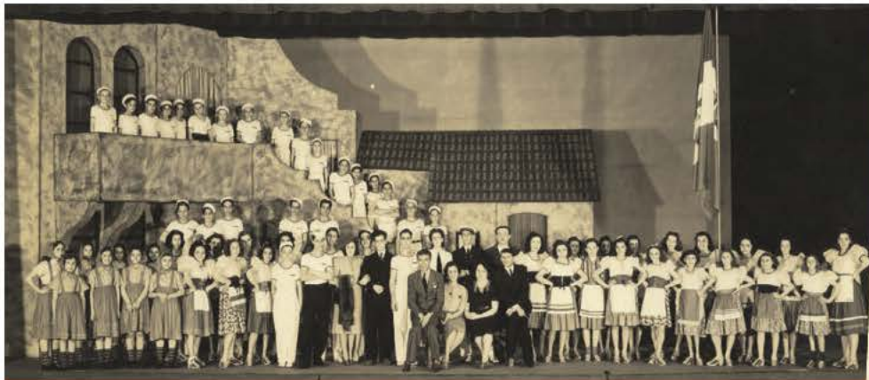
Performances by the Lega Toscana raised money for various charities, including the Memorial Home for Crippled Children and St. Anthony's Village Orphanage (also known as St. Anthony School for Exceptional Children), and post-war relief efforts in Italy.