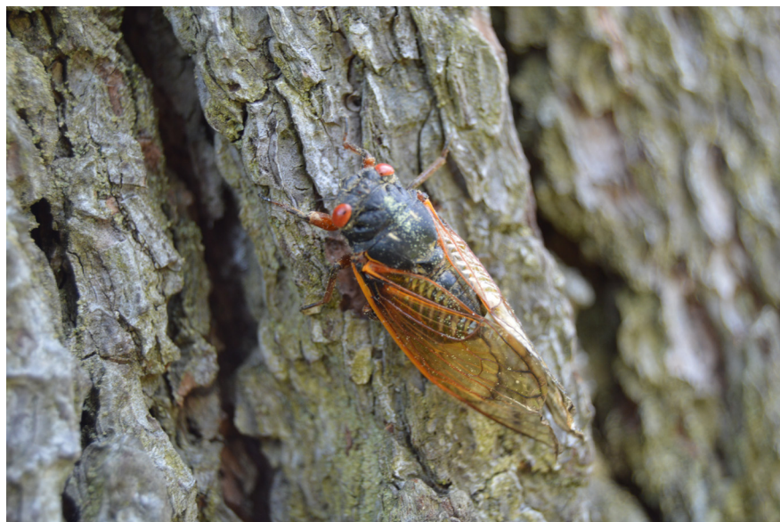
One of the millions of periodical cicadas that visited Meadowcroft in June.