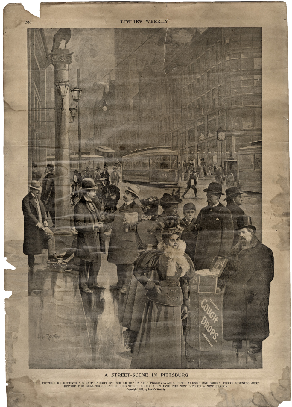
A STREET-SCENE IN PITTSBURG

It is unclear when Orton moved his sales to the streets of Pittsburgh and took up his signature look that included a fur coat, top hat, and red box advertising his homemade remedy, but by the late 1880s he was a fixture on the city streets. Stories of "Double X" often