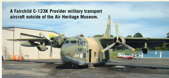
A Fairchild C-123K Provider military transport aircraft outside of the Air Heritage Museum.