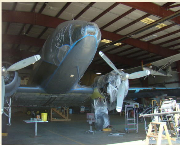
C-47B Skytrain “Luck of the Irish” in the final stages of its WWII paint scheme.