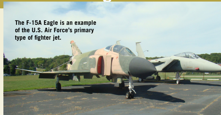
The F-15A Eagle is an example of the U.S. Air Force's primary type of fighter jet.