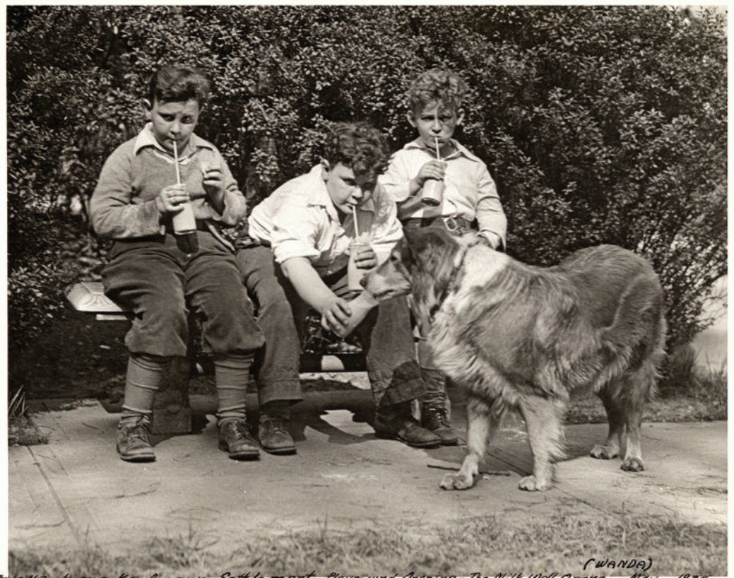
#10443 Irene Kaufmann Settlement Playground Opening - The Milk Well Opens Nov 1934 (WANDA)