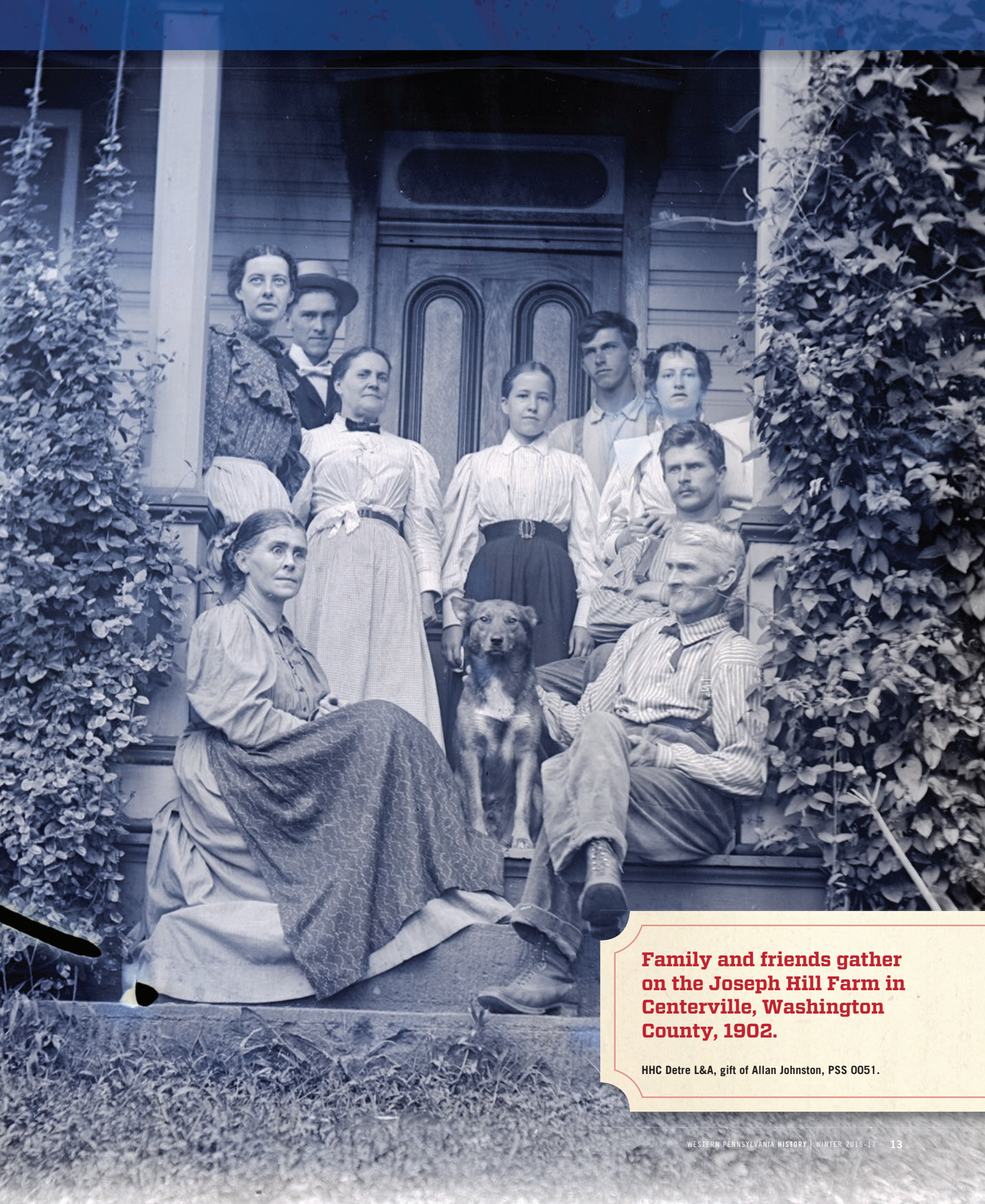
Family and friends gather on the Joseph Hill Farm in Centerville, Washington County, 1902.