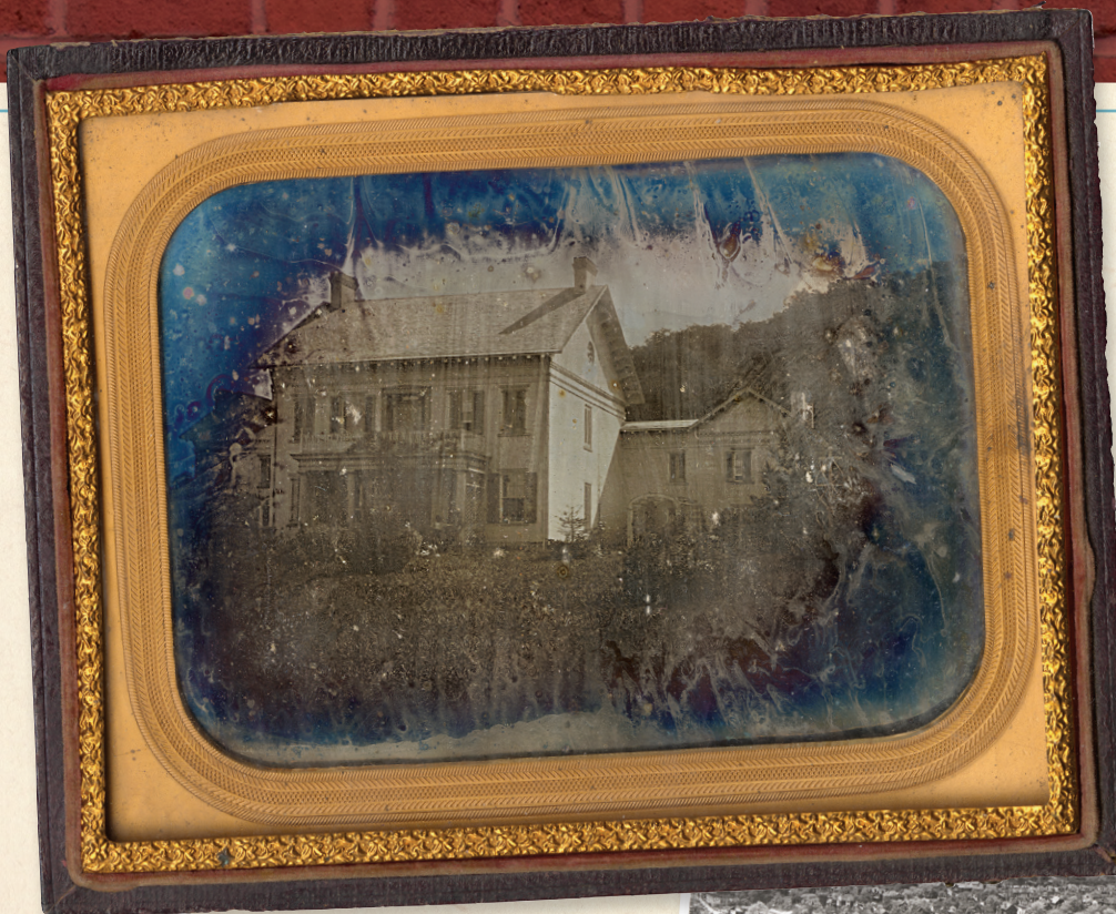
Thomas Mellon house 401 Negley Avenue, East Liberty, 1850s. Daguerreotypes taken outside of a studio were quite a rarity. Lawyer and banker Thomas Mellon not only had daguerreotypes of his family, but of his house as well.