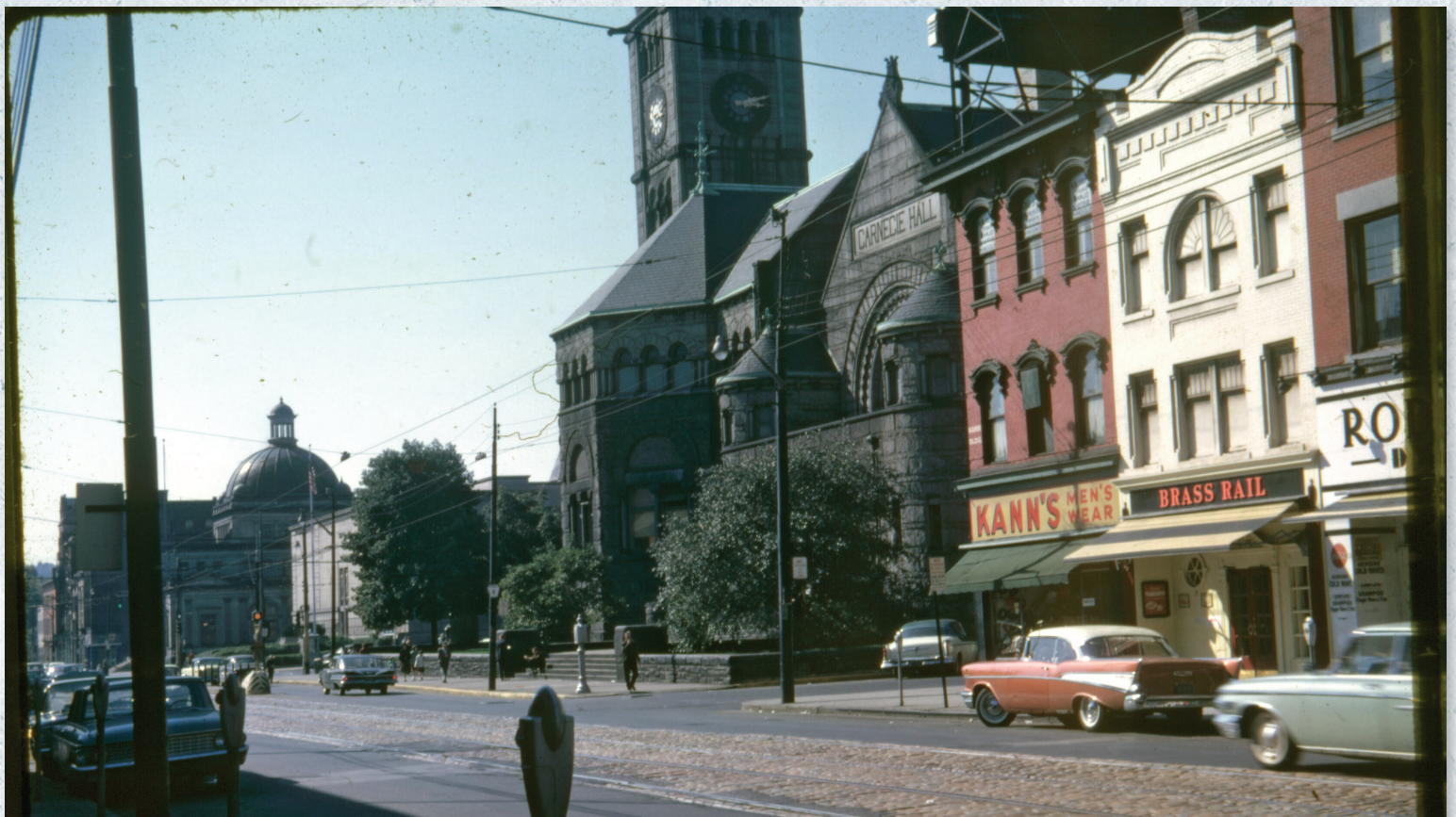
East Ohio Street with the Carnegie Library (center), Buhl Planetarium (left), and the old Post Office (far left with dome), 1960s.