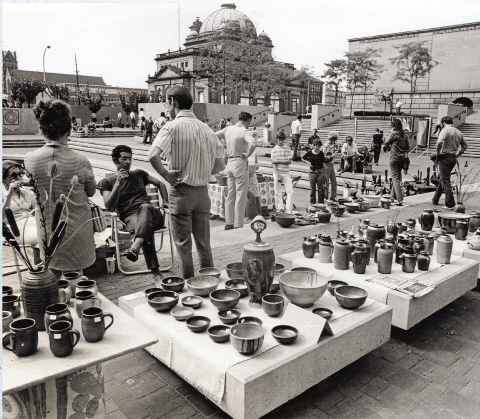
Craft sale in Allegheny Center, 1970s.

HHC Detre L&A, gift of Al Mazukna, 1998.0030.