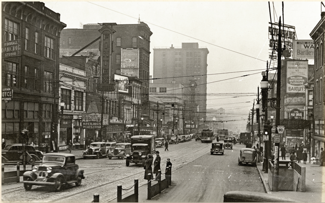
Penn Avenue looking toward Highland Avenue, 1930s.

In its heyday before World War II, Penn Avenue featured drug stores, department stores, specialty shops, and theaters.