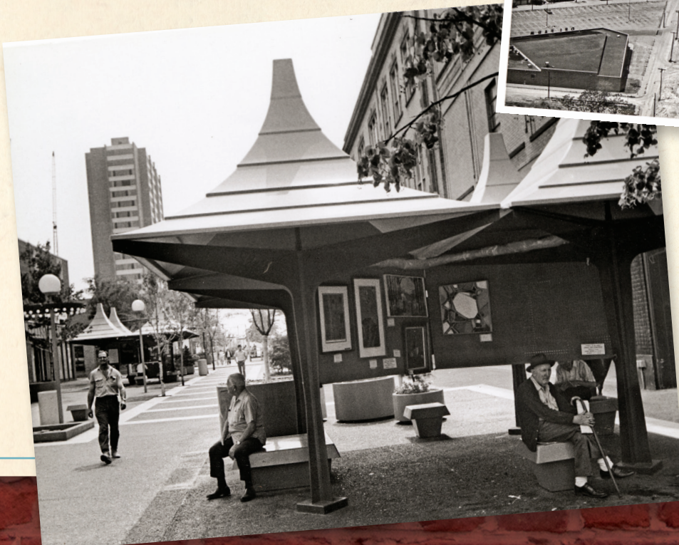
East Liberty Pedestrian mall, c. 1970. Closed to vehicular traffic, Penn Avenue became a pedestrian mall.