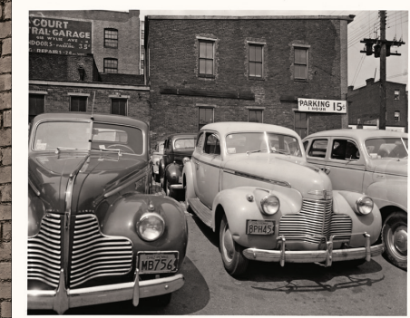
Parking lot near 40 Water Street, formerly located at the Point in downtown, September 8, 1941. Water Street disappeared from the map during the creation of Point State Park.