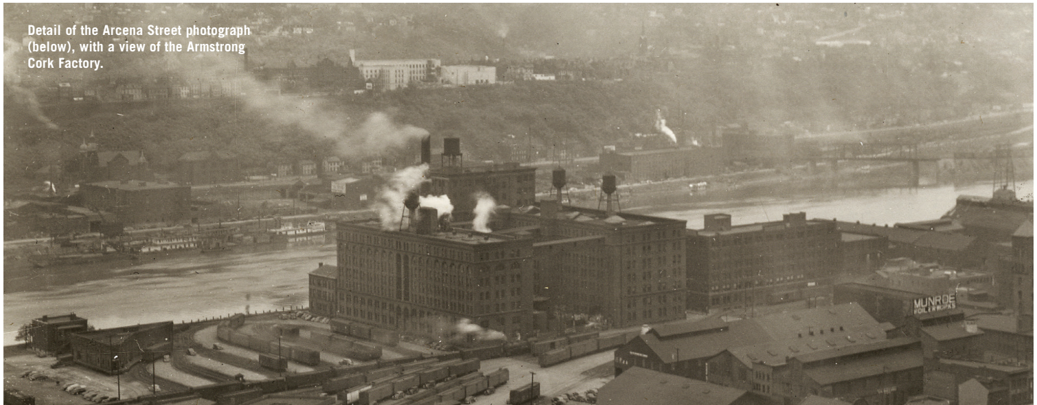
Detail of the Arcena Street photograph (below), with a view of the Armstrong Cork Factory.

information on the back of each print: a date and a location. Comparing these historical photographs to contemporary images of the same location reveals that many of these buildings no longer exist. In certain cases, particularly surrounding sites of future urban redevelopment projects, even entire streets have vanished.