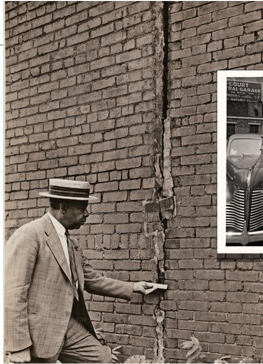
Inspector measuring a crack on a house at 2501 Wylie Ave. in the Hill District, August 16, 1940.

This lack of documentation is somewhat offset by the inclusion of two key pieces of