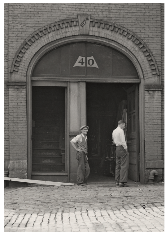
Men standing outside 40 Water Street, formerly located at the Point in downtown, September 8, 1941. Water Street disappeared from the map during the creation of Point State Park.