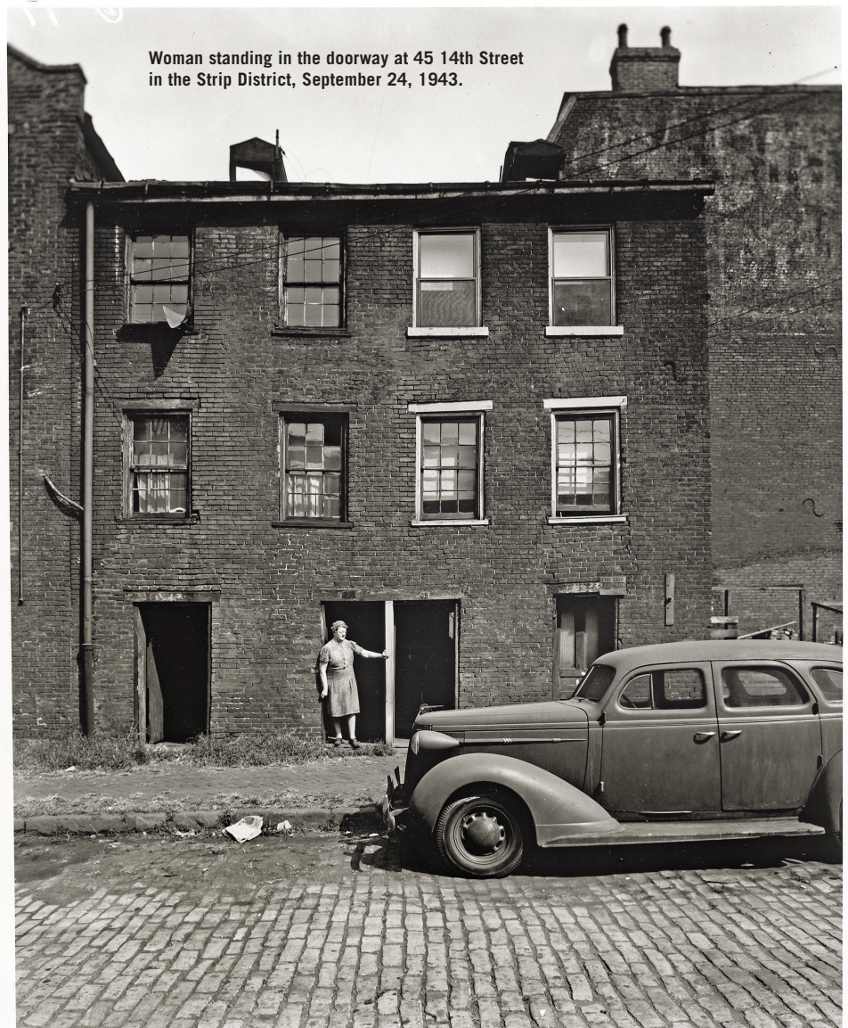
Woman standing in the doorway at 45 14th Street in the Strip District, September 24, 1943.