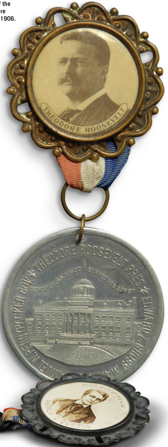
Semi-centennial Loyal War Governor's Conference commemoration badge, 1912.