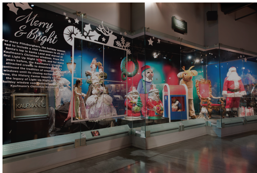
Santaland artifacts that will be on display in A Very Merry Pittsburgh .

This Christmas, relive those cherished memories as part of A Very Merry Pittsburgh , featuring artifacts from Kaufmann's/Macy's department store, Christmas lights, and one-of-a-kind nostalgic experiences for the whole family to enjoy. Each day through Christmas Eve from 11 a.m. to 2 p.m., take your own photo with Santa Claus sitting in an exact replica of the chair used in the store's historic Santaland display.