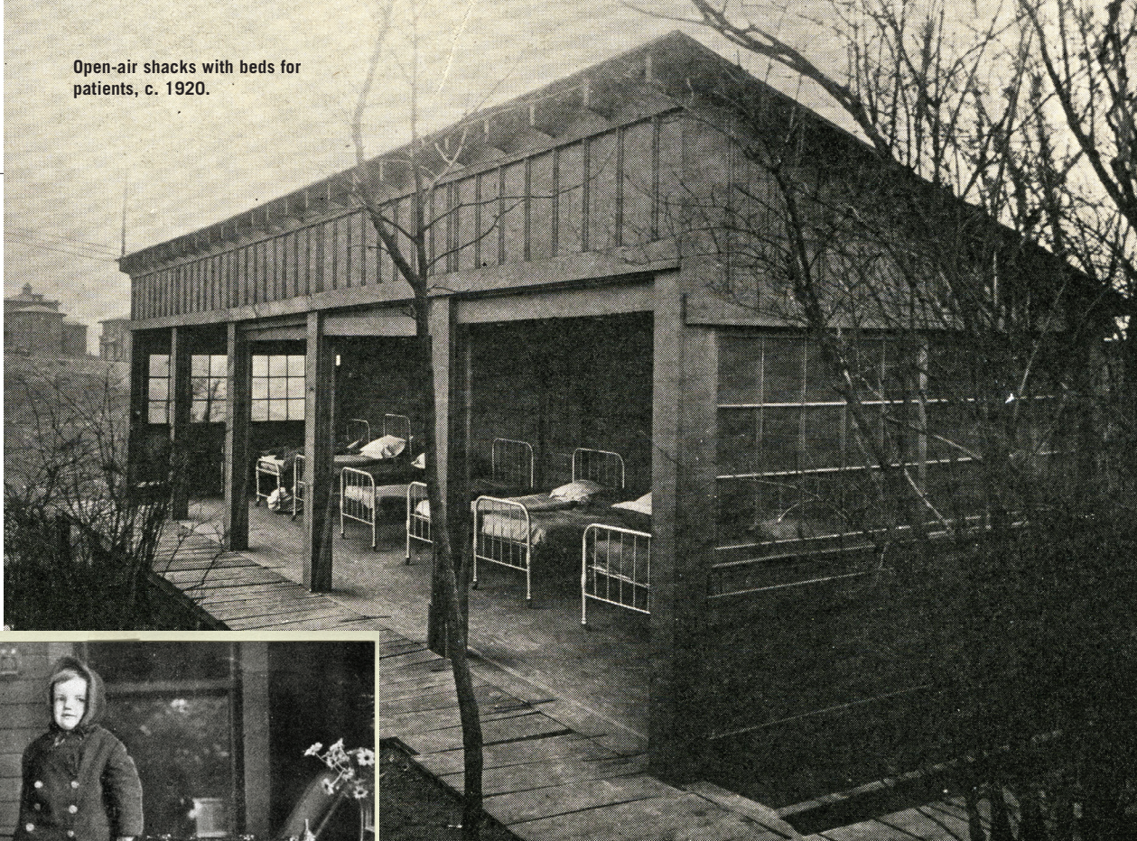
Open-air shacks with beds for patients, c. 1920.