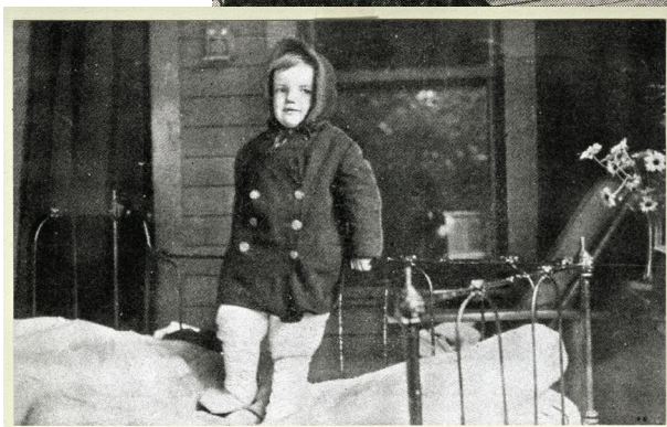
A child on a bed on the porch of the Tuberculosis League of Pittsburgh's Hospital.