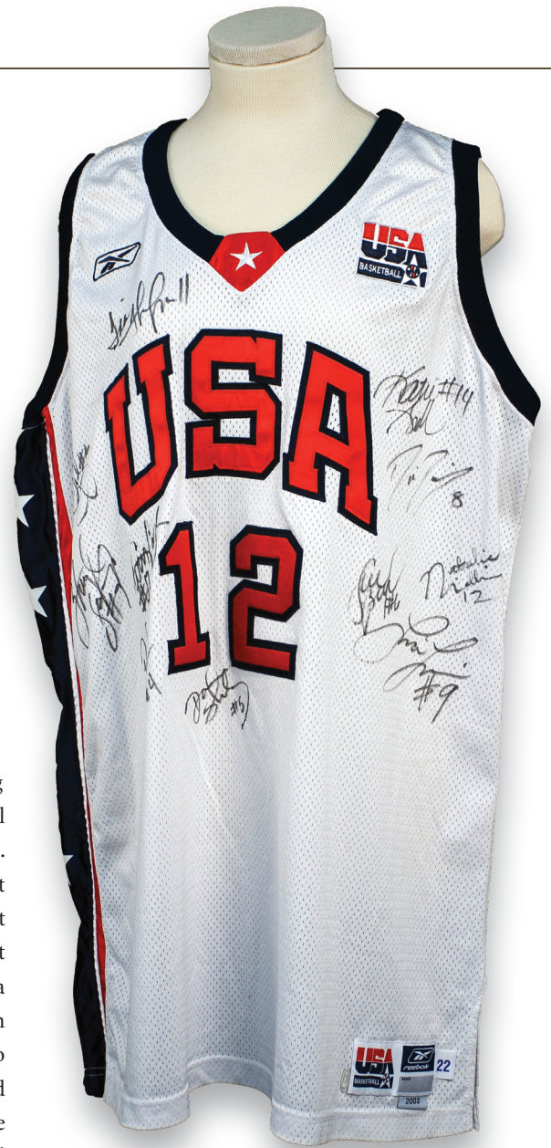
▲ Swin Cash Olympic jersey, 2004. Curators and archivists have built the sports collection largely in the past 15 years. Photographs of the artifact collection, which is focused on game-used equipment, have encouraged museum visitation by people who read the magazine online. McKeesport native Swin Cash played forward on the Olympic gold medal winning U.S.A. women’s basketball team in 2004.

This list also reinforces our understanding about the early history of the Historical Society and how staff built the collection. Newspaper accounts of the establishment of the organization in 1879 show that most donors and supporters belonged to prominent families. In fact, most members favored a requirement that new members had lived in the region for at least 35 to 50 years. They also suggested that the Society be called The Old Residenter’s Association, further signifying the exclusivity of the organization. The personal interests of those members influenced the collection. It came to represent the history and stories that members valued—with strengths