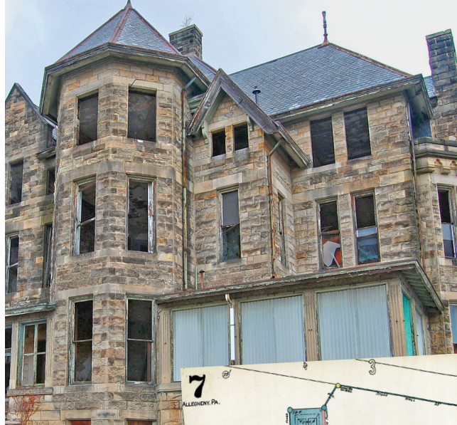
The former warden's house faces what was originally the penitentiary's front yard on the banks of the Ohio River. Prisoners once entered through the basement. A 1984 master plan re-oriented the site entrance to face a parking lot on Beaver Avenue. The flat roof of the cell blocks dates to 1959.

The late Victorian prison embodied the conviction that an environment conducive to rehabilitation could achieve that goal. When Western State Penitentiary's Victorian roof was removed in 1959, the new flat roof was in