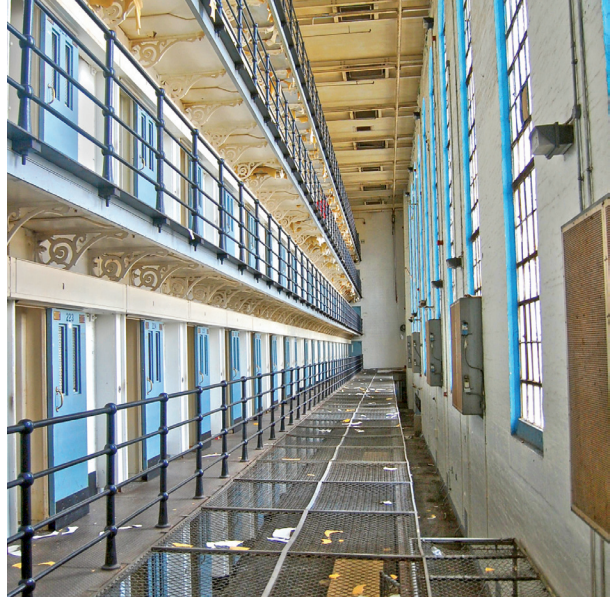
Cell block, north wing, showing Auburn-style arrangement of tiered ranges facing full-height ventilation shafts. Original iron barred doors were replaced with steel doors in the 1980s, and metal grates were installed to protect guards from objects thrown or dropped from above.