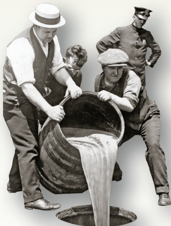
Prohibition agents pour liquor into the sewer while the New York City Deputy Police Commissioner looks on, 1921.

Step back in time to an exhilarating era of flappers & suffragists, bootleggers and temperance workers, and the infamous Al Capone and Carry Nation.