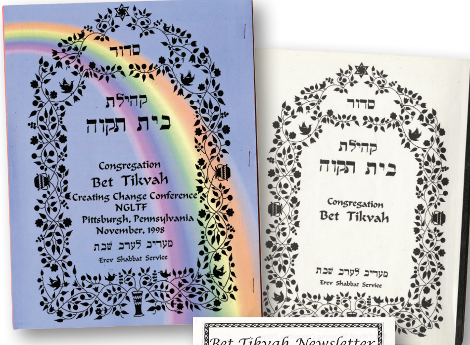
The cover of the first edition of the Bet Tikvah Congregation prayerbook for Erev Shabbat services on Friday evenings, created in March 1995.

Bet Tikvah Congregation made a special prayerbook when the National Gay and Lesbian Task Force held its "Creating Change" conference in Pittsburgh in 1998.