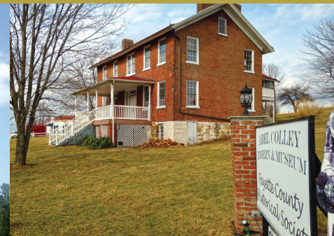
South and east elevations of Abel Colley Tavern and Museum.