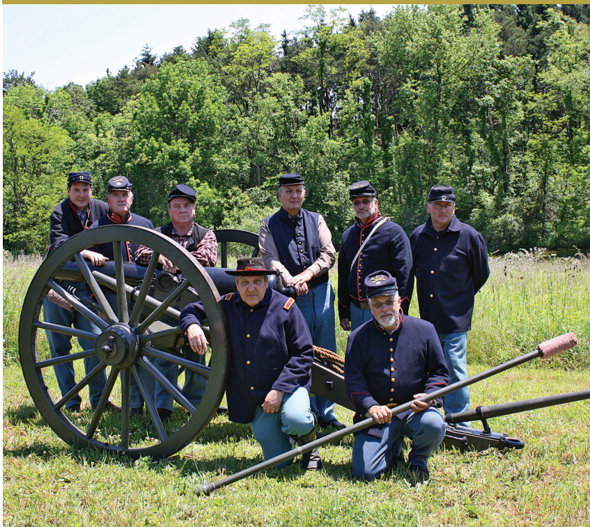
Reenactors gather during a Civil War Encampment.