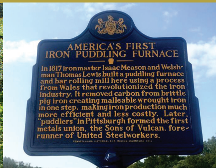
Pennsylvania State Museum Commission iron puddling marker dedicated in 2017.