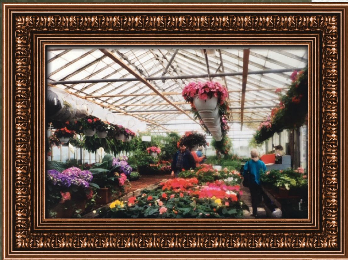
The greenhouse stocked with colorful annuals. Mom is in the blue sweater in the far background.