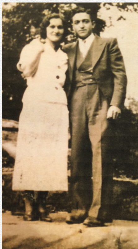
Mom and Dad's engagement photo, 1935.

My parents moved to the third floor of my grandparents' home at 3238 Juliet Street, Oakland. No longer employed at Pitt's print shop, and with a limited formal education, Dad accepted any job that he could find: a road checker during Governor George Earl III's administration, a chauffeur in the winter months for a prominent Pittsburgh physician, and part-time defense work for the Miller Printing and Machinery Company on Pittsburgh's North Side. 11