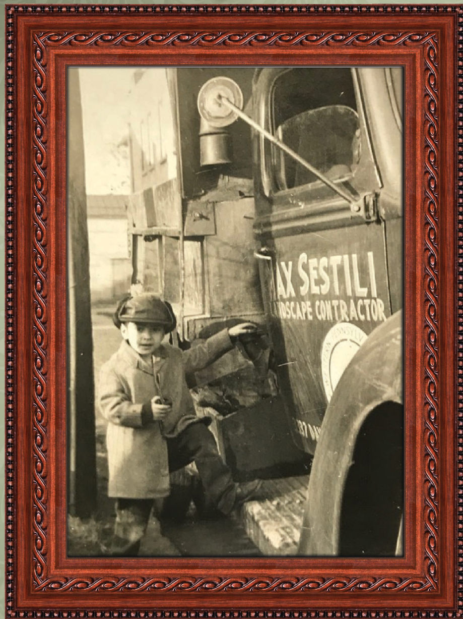
ABOVE: Dad's first truck with the business name, c. 1946.

I don't know exactly when Dad's love of nature began