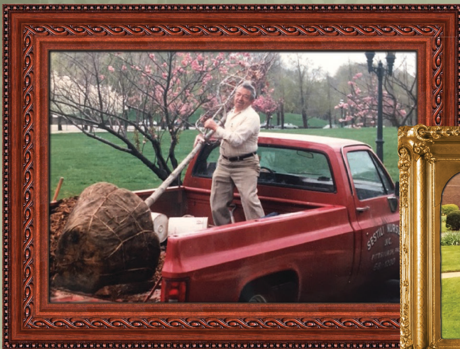
LEFT: Dad preparing the site to plant the Scarlet Oak Tree on Oakland's Phipps Conservatory grounds. It is located near the Columbus statue.