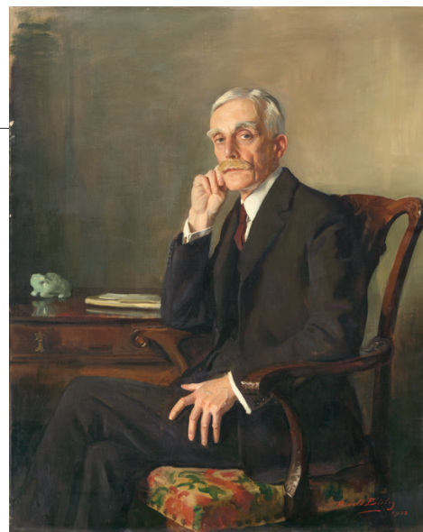
Andrew William Mellon by Sir Oswald Hornby Joseph Birley, oil on canvas, 1923.

Nearly 60 works of art from the Smithsonian's National Portrait Gallery are on exhibit as part of Smithsonian's Portraits of Pittsburgh: Works from the National Portrait Gallery . The exhibit features original paintings, sketches, photographs, and prints that showcase more than 100 people who exemplify the innovations, challenges, and motivations that have shaped this region and our nation. Visit heinzhistorycenter.org/portraits for more information.