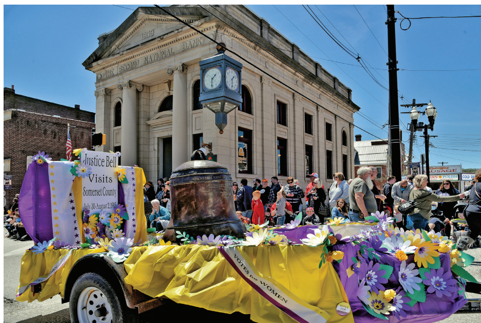
Meyersdale Public Library's Justice Bell Float in the Pennsylvania Maple Festival Grand Feature Parade, May 1, 2021.