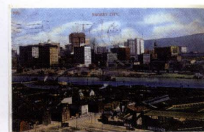
Cover: A rare color view of Exposition Park from a postcard looking across the Allegheny River to Pittsburgh.