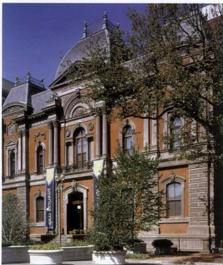
Renwick Gallery, Washington, D.C.

The Second Empire name refers back to France under Napoleon III, whose reign (1848-1870) brought a renewed luster to Parisian fashions in clothing and architecture. Architects and those charged with building public spaces in the U.S. traditionally traveled to Paris to observe and understand what was then considered good design. What they found after 1857 was Ludovico Tullio Joachim Visconti and