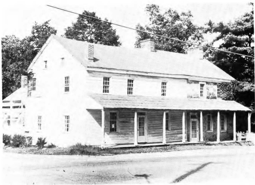
Compass Inn, Laughlintown, Pennsylvania July 1970