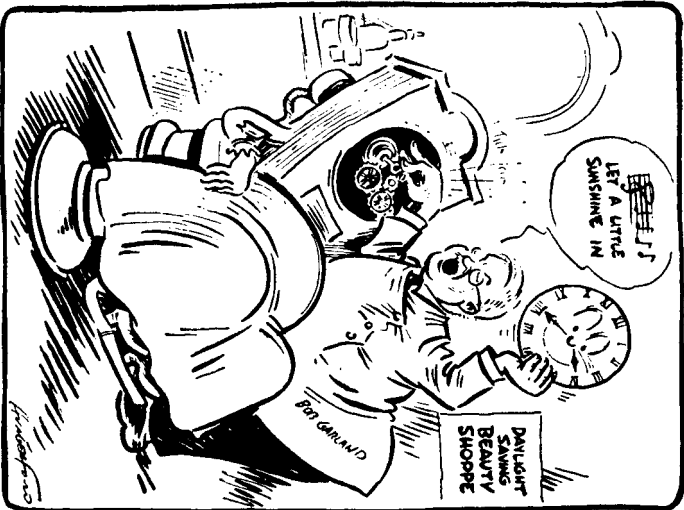
Having Its Face Lifted Again—By Hungerford

PITTSBURGH POST-GAZETTE: SATURDAY, APRIL 24, 1937