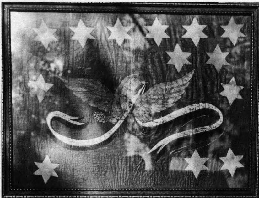
The flag of those opposing the federal government's whiskey tax is now on display in the Century Inn in Scenery Hill, Pa. The original is deep blue behind the stars.

under consideration by the state legislature, and "in future our decision thereon shall be considered as instructions to our representatives." 17