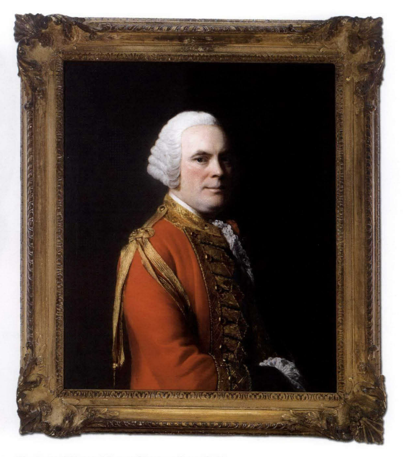
Lieutenant General James Abercromby , c. 1760 Allan Ramsay Oil on canvas, 30-1/2 x 25-1/2 inches Collection of the Fort Ticonderoga Museum